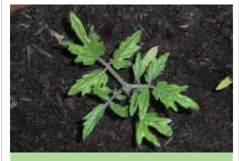
A well-established tomato seedling with three true leaves