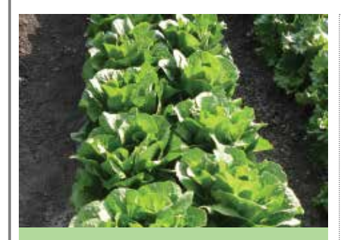
Greenhouse-grown lettuce will provide a crop in as little as 3 to 4 weeks

lishment of strong and secure root systems by using Omex Nami (Bio 20) will go a long way to counteract the effects of these microscopic round worms," says Peter.