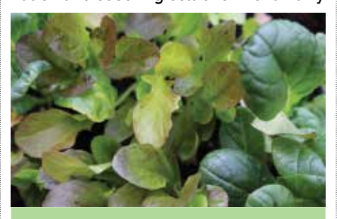
Mixed-salad leaves are increasingly popular in European markets

Omex Nami (Bio 20) is applied as a foliar spray at the seedling establishment stage to promote root growth and development thus maximising uptake and utilisation of water and nutrients. "Root systems form the very foundation of plant anchorage and subsequent stability for the uptake of water-soluble nutrients via the root hairs. The uniquely effective nutrient-supply/biostimulant-boost format of Omex Nami (Bio 20) ensures the crop, whether tomato, cucumber or lettuce, gets off to a flying start. Such assistance is especially important for seed germination and seedling establishment. Early