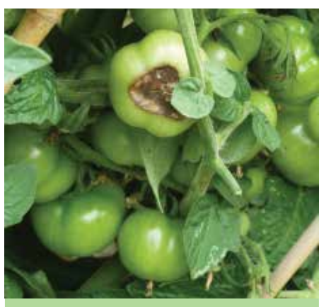
Calcium deficiency is the primary cause of blossom end rot in tomato

Calcium as calcium pectate cements the walls of adjoining cells together to form strong and rigid plant tissues. Any shortfall in calcium will correspondingly show up as tissue structure-related deficiency symptoms. Blossom end rot (tomato, capsicum pepper, aubergine and cucumber), bitter pit (apples and pears), tip burn (lettuce) and internal browning (potato tubers) are some of the most frequently occurring and best known effects of insufficient plant available calcium. Symptoms such as blossom end rot with a shortfall in calcium as the primary