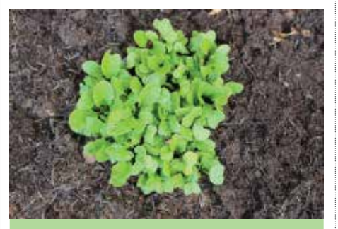
Crowded seedlings in the nursery seedbed are highly prone to damping off – radish is shown here

Good seed germination and unimpeded seedling establishment in crowded seed beds followed by transplanting out and associated 'transplant shock' are times when salad crops like tomato are at their most vulnerable.