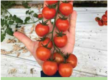
Growers who follow a well-structured programme of foliar feeding can expect superb crops of tomato like the cherry tomato shown here

Damping off disease is caused by multiple pathogens, including fungus-like Phytophthora and Pythium and true fungi such as Rhizoctoni and Fusarium. "Omex Nami (Bio 20) applied during this early stage generates stronger seedlings with more robust shoots and stems to help young plants avoid or overcome damp-